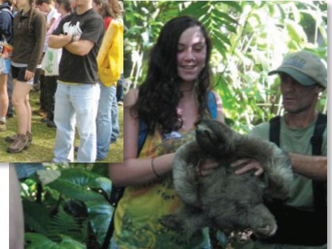
Right: At the National Institute for Biodiversity's Education Center

Students in the Mindfulness class were assigned readings and exercises on "mindfulness" meditation practices designed to help the development of clear, present moment awareness in a systematic way. Mindfulness has been demonstrated to be useful in psychology in promoting mental health and well-being and has been incorporated into many different kinds of treatment programs.