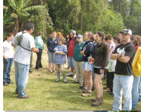
Left: Visiting a high school, Santa Elena, Costa Rica

Students taking the Ecotourism course had been assigned preparatory readings on the topic of ecotourism and about Costa Rica's tourism industry. During the trip, they were instructed to observe a variety of interactions between tourists and the Costa Rican citizens as well as observing the operations of Costa Rican ecotourism businesses. They kept journals of their observations and turned those into oral presentations upon their return to Concord.