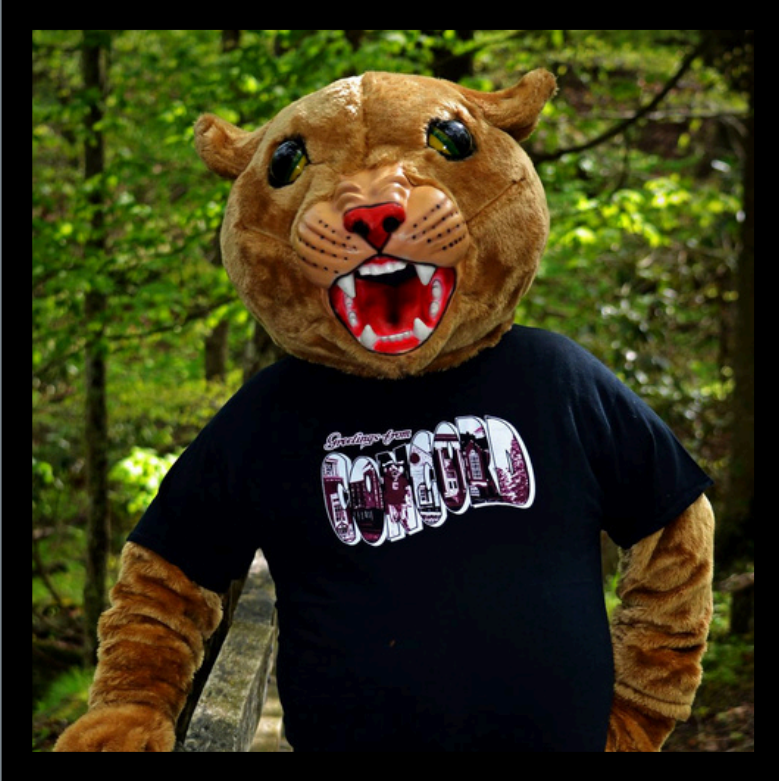
Hunter Sutherland Lead Cook Aramark

“Hunter makes sure to make you laugh and is overall a good employee!”