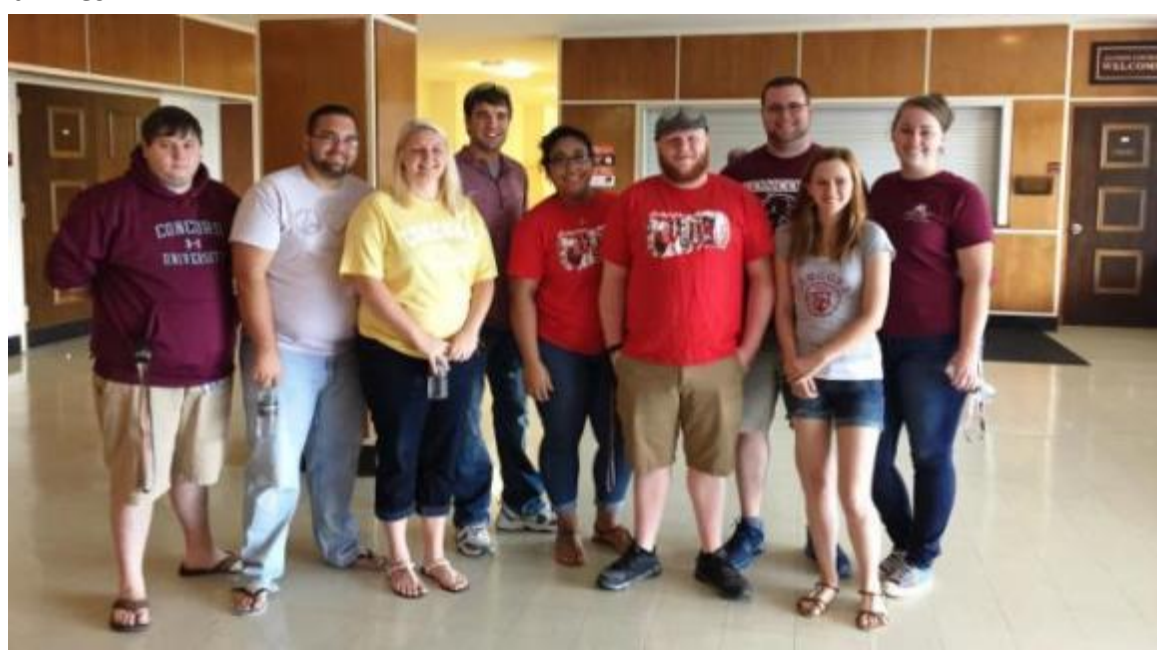
Our amazing Orientation Leaders 2015!