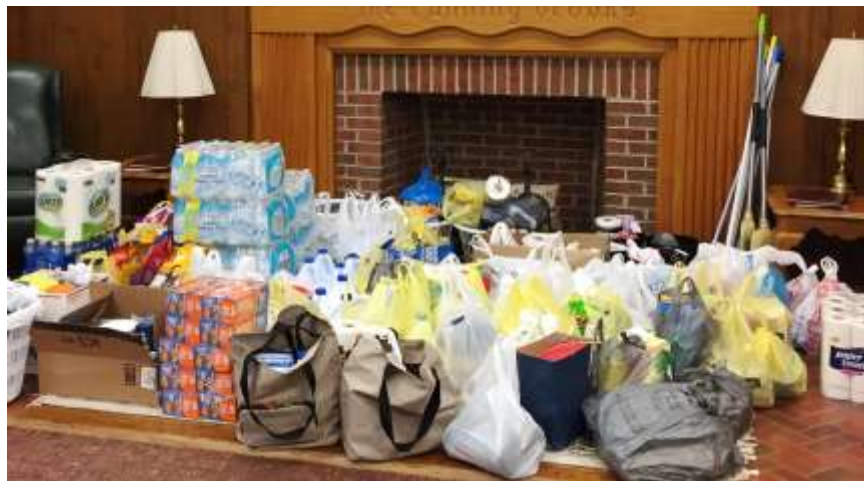
A Small Sampling of Day #1 Donations from CU Community

Concord University extends our heartfelt support to our fellow West Virginians affected by the June 2016 floods. Some of our students, staff, and faculty have been directly affected. To assist in clean-up efforts, Concord launched a collection drive for June 27 & 28, with supplies delivered to the United Way's Beckley location on Wednesday, June 29. Many members of our CU family have volunteered time, money, and supplies to help our struggling communities. If you or your student have questions or concerns because of flood-related issues, please contact the Office of Student Affairs ( studentaffairs@concord.edu , 304-384-6035) or the Academic Success Center ( asc@concord.edu , 304-384-6074).