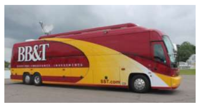
Students can learn all about fiscal responsibility via the BB&T bus