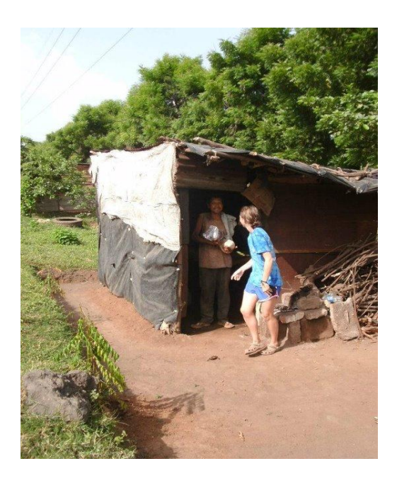
Distributing beans and rice to a local village