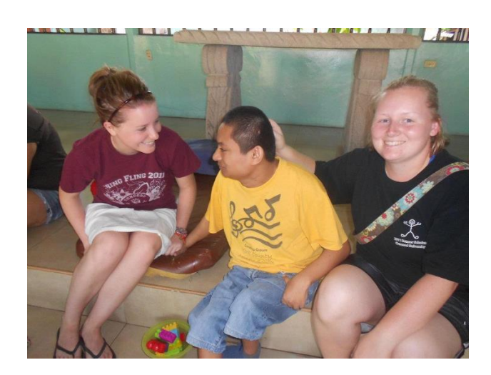
Visiting the special needs orphanage