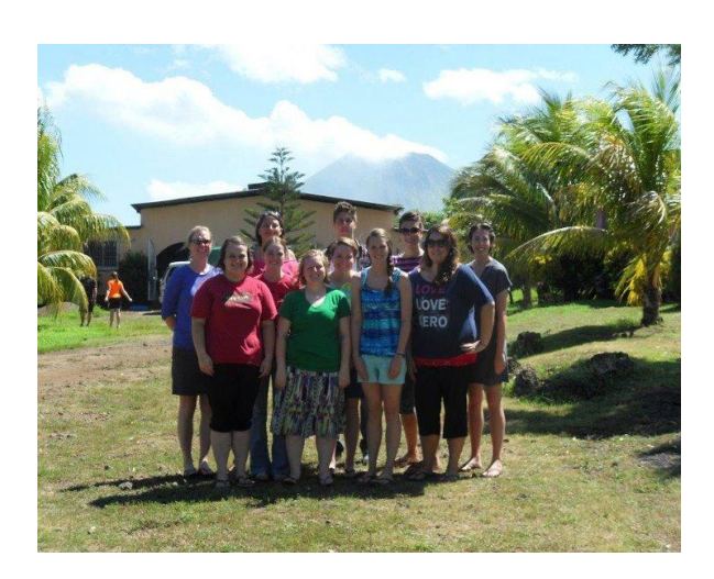
Bonner Scholars in front of Vision Nicaragua's Mission Center (Yes, there's a volcano in the background!)