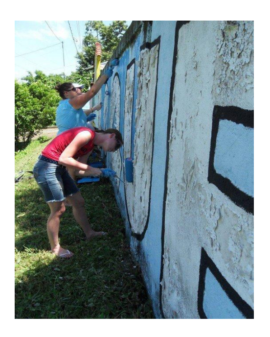
Painting Vision Nicaragua's Mission Center