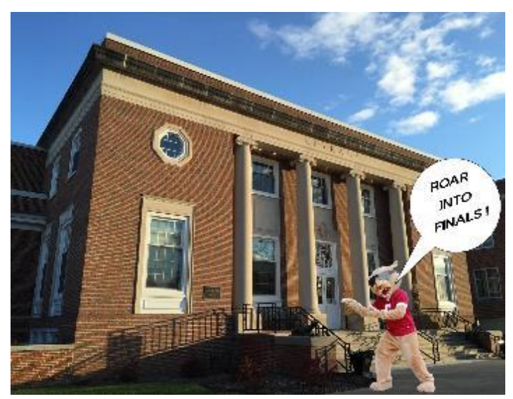
The Library staff wishes everyone the best during finals!

It wouldn't be college without the stress of Finals Week! As your students complete their projects, study for exams, and submit those last minute assignments, Student Activities plans some diversions to ease the strain (see poster below). In addition to the Library remaining open non-stop from Sunday, December 6 at 2pm until Friday, December 11 at 4pm, various offices and Student Affairs provides some relief in the form of pizza parties (courtesy of the Geographic Alliance), free coffee, 24/7 study areas, a free late-night breakfast served by CU faculty and staff, and more.