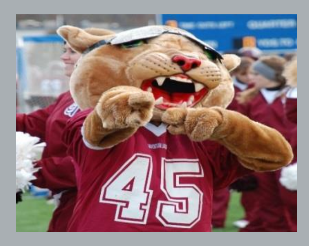
Concord's Mascot "Roar"