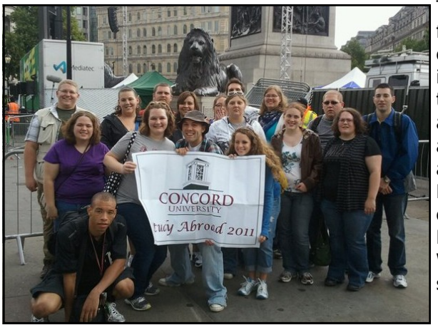
Concord Students at Trafalgar Square on the 2011 Bard Study abroad trip to the United Kingdom

The Russia trip is coordinated through the Social Science division and includes a partnership with Russian faculty and students.