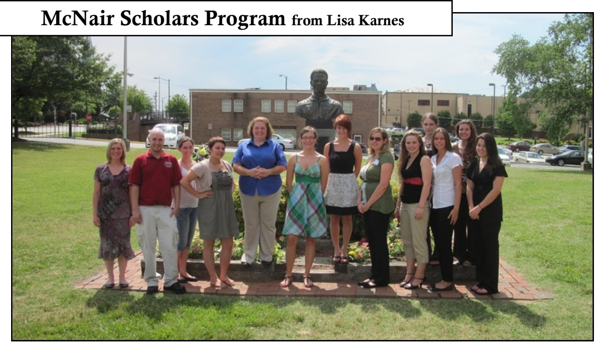
Concord University's 2011 McNair Scholars @ North Carolina A&T University